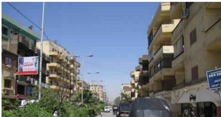
a. Luxor city facades painted in light yellow.