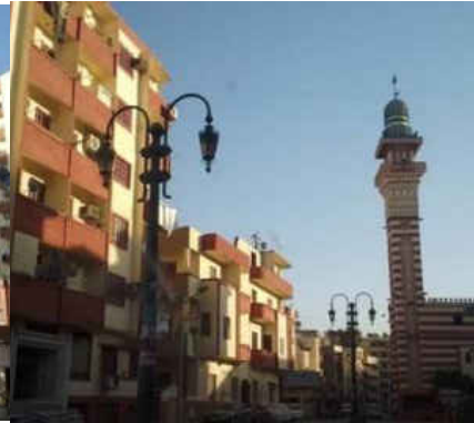
Fig. 6: Sity Street : the right part is a mousque – the left part is residential buildings.