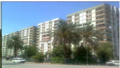
d. Al-Azhar street