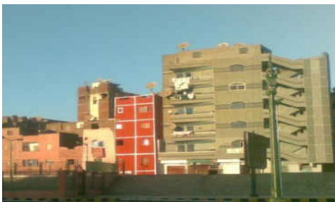
c. El Gaish street.