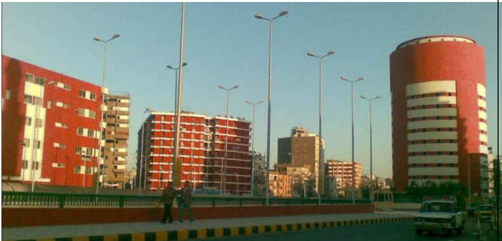
Fig. 4: Yousry Ragheb street:the right part of the image is a water tank tower – the middle part is a residential building – the left part is an office building. All had been painted by the same colors ( dark red and white yellow).