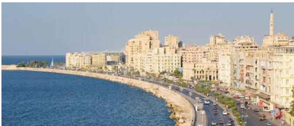
b. Alexandria city facades painted in white.