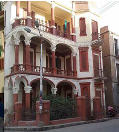
b. Old residential house in Mohamed Ali Makarem st.