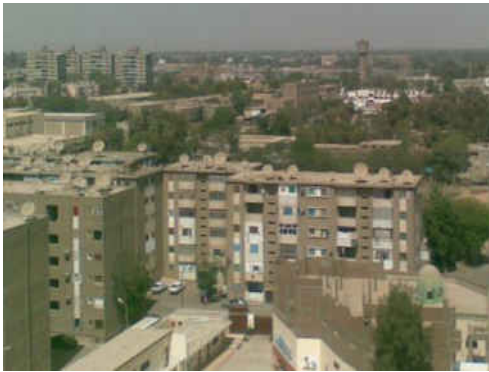
a. Ezbet Elseign area