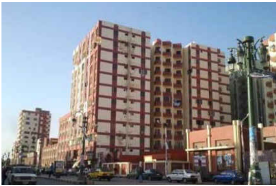
Fig. 5: El-Gamaa street: the frontal part of the image is a partial sanitary station - the higher buildings are residential buildings.