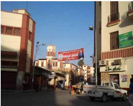
a. Cheicoril square.