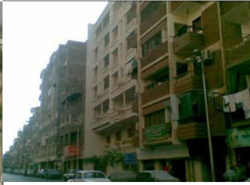
b. Mahmoud Rashwan Street